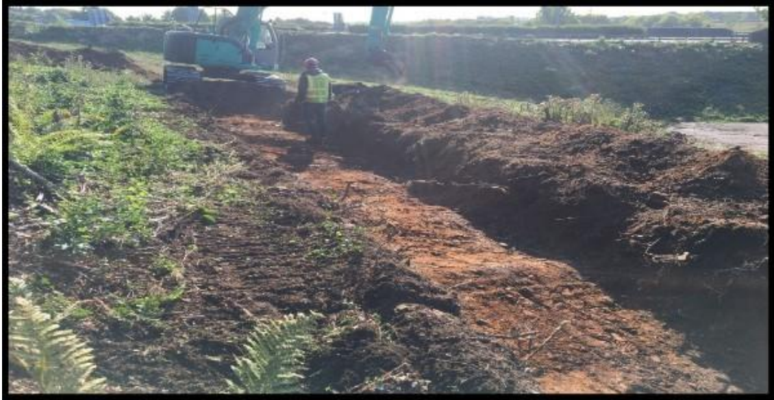
Archaeological test trenching ongoing near the M8 Motorway at Dunkettle.