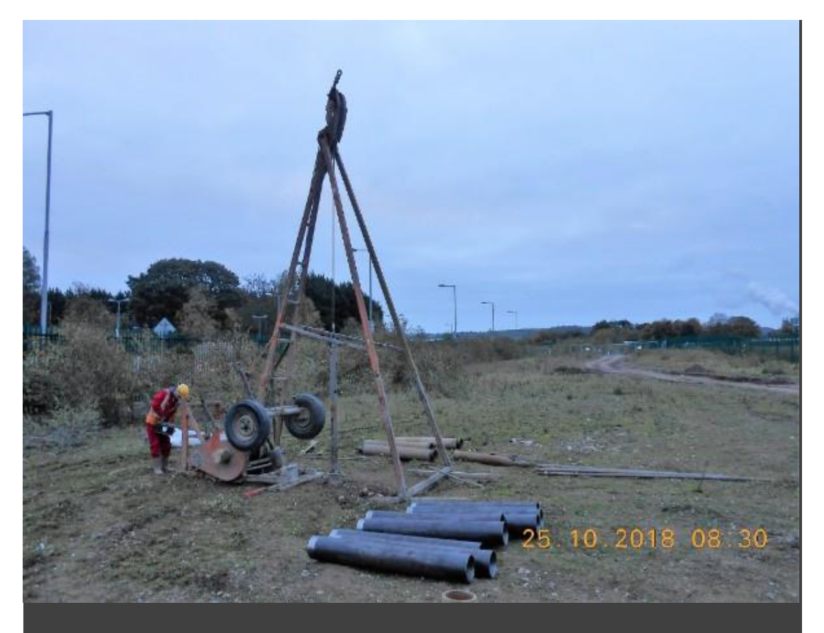
Ground Investigation Works south of the N25