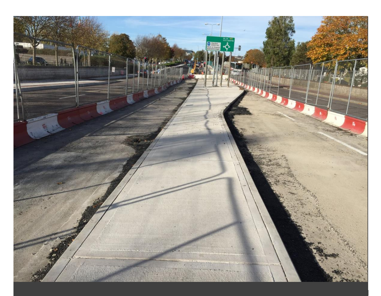
Sarsfield Road median works looking north

Upgrading Sarsfield Road to facilitate sustainable transport modes such as walking, cycling & public transport.