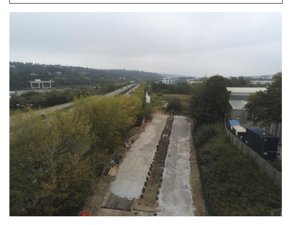
Preparatory works for piling nearing completion.

months and details/updates will be provided as the works progress. See photograph below.