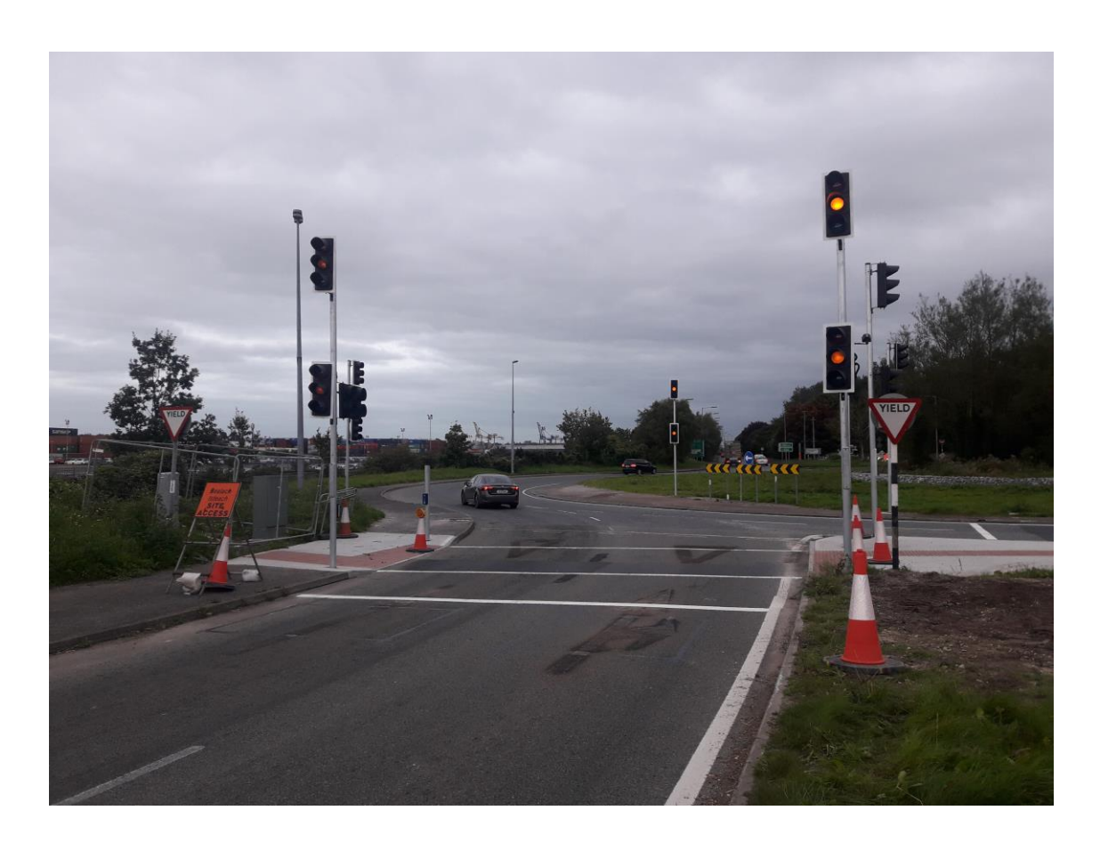
Dunkettle Roundabout traffic lights prior to activation