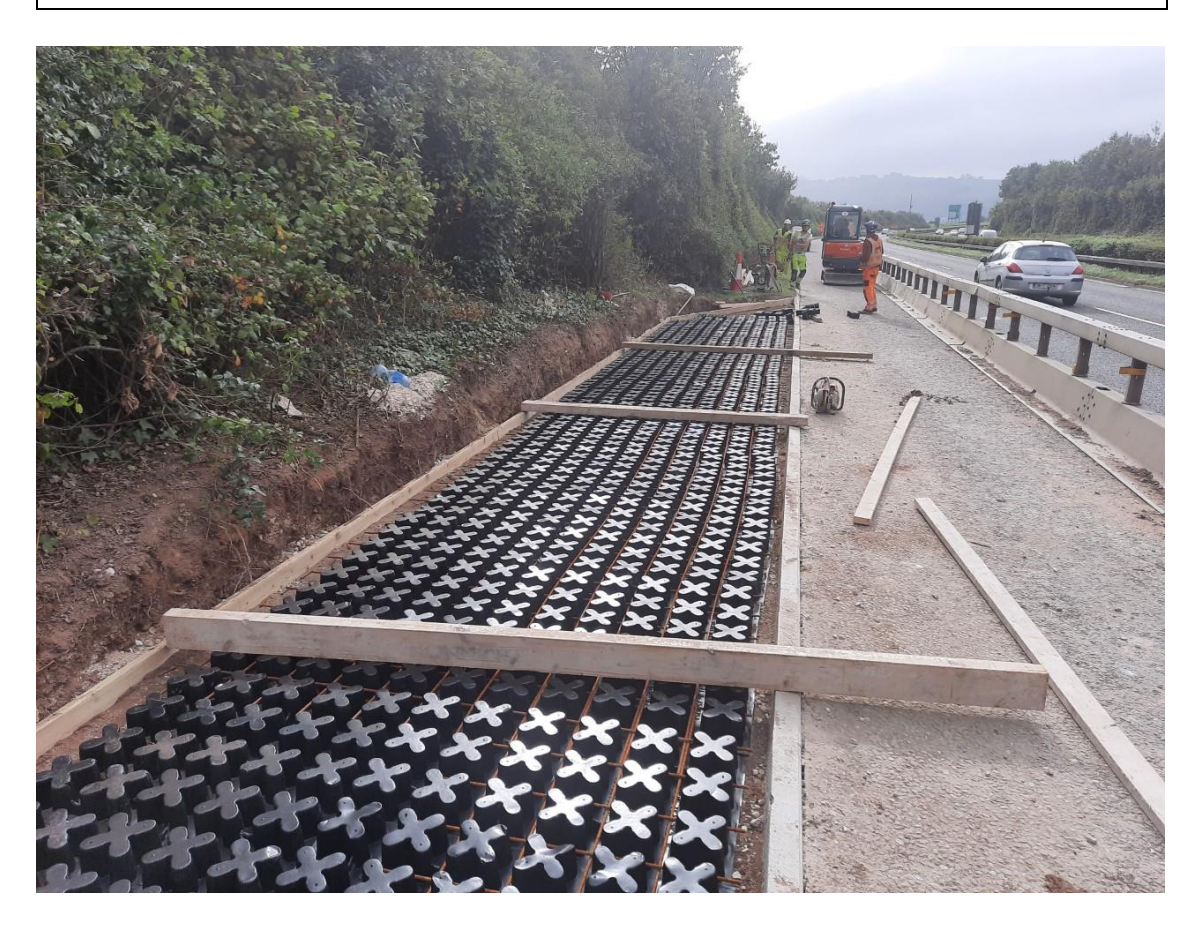
Lay-by currently under construction just South of the Jack Lynch Tunnel westbound on the N40.

We do not anticipate any significant disruption to traffic as a result of our works on either the N40 or at Dunkettle Interchange over the coming week.