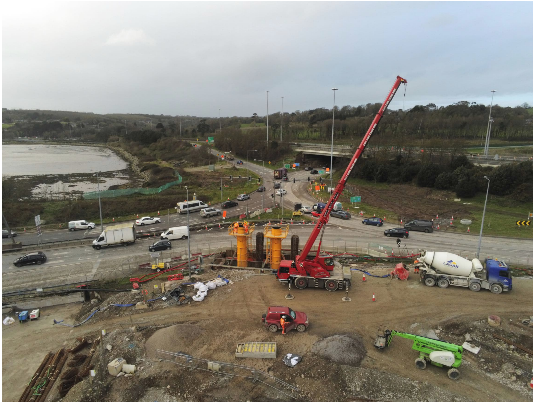
Demolition works underway at the existing Irish rail bridge over the Cork to Midleton railway line.

Also under night time working, we are progressing the demolition of the existing railway bridge in the Structure St08 are as highlighted above. In this case, night time working is essential in order to keep the Cork to Midleton railway line live during daytime hours for commuters – see photograph below.