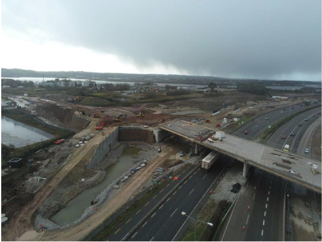
Embankment construction works ongoing alongside the N25.

We still anticipate that Link U will be the next link road to open. Night time working will be required for both the N8 / Link U tie in and also the Link U / M8 tie in – details to follow in future updates.