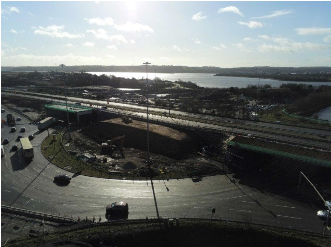
Link F embankment construction within the Dunkettle Interchange Roundabout.

The section of Link F within the centre island of the Dunkettle Interchange Roundabout is ongoing under night time working. The work has to be done at night as it requires a partial closure of the roundabout. Link F as highlighted on the map above will form the free flow link from the Tivoli Roundabout to the Jack Lynch Tunnel - see photograph below.