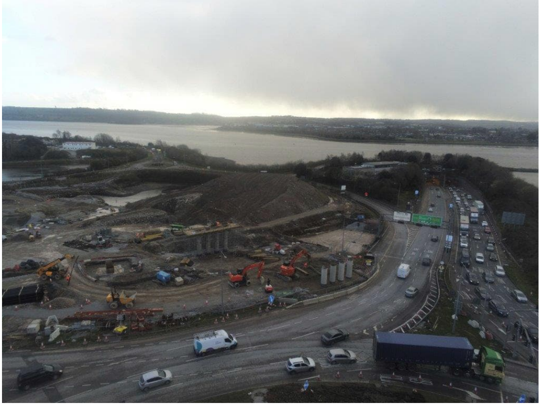
Works ongoing on site for the construction of Structure St05.

The section of Link F within the centre island of the Dunkettle Interchange Roundabout is ongoing under night time working. The work has to be done at night as it requires a partial closure of the roundabout. Link F as highlighted on the map above will form the free flow link from the Tivoli Roundabout to the Jack Lynch Tunnel - see photograph below.